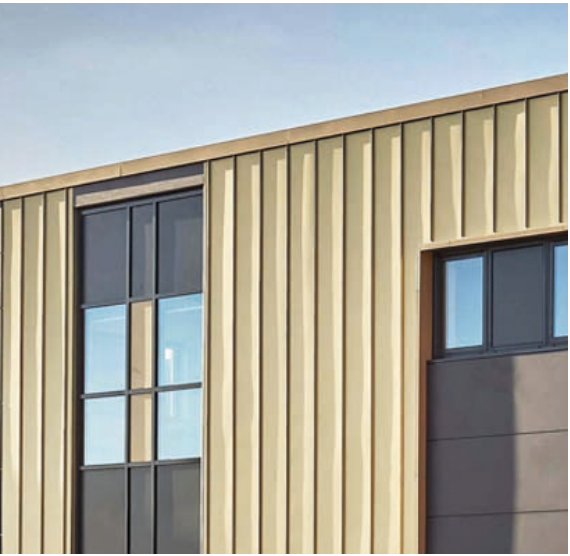
Seamed Metal cladding